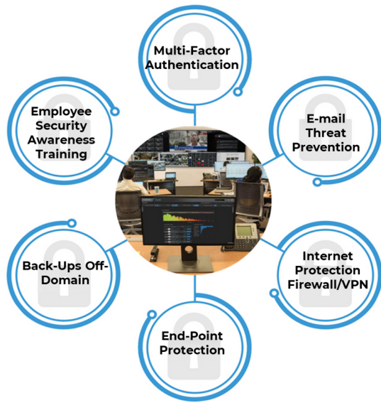
Managed User Based Layered Security